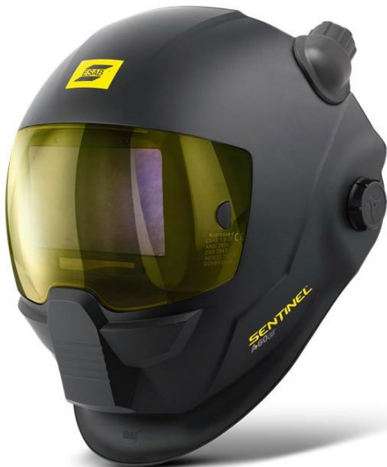
Sentinel A60 Air