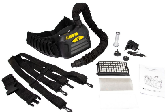
EPR-X1 PAPR System