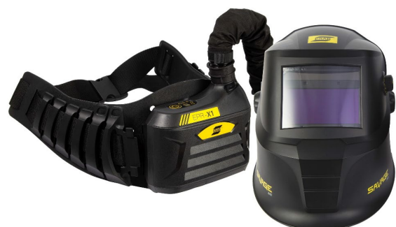
EPR-X1 with Savage A-40 Air Helmet